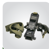
PADST HELMET MOUNT KIT ACGOPS15HMNP