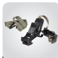
MICH HELMET MOUNT KIT ACGOPS15HMNP