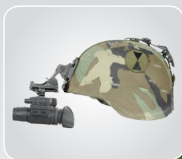
PS15 WITH HELMET MOUNT ASSEMBLY