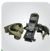
PADST HELMET MOUNT KIT ACGOPS15HMNP