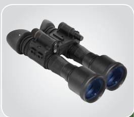
PS15 WITH 3X LENS