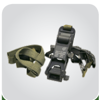
PADST HELMET MOUNT KIT ACGOPS15HMNP