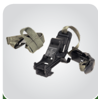
MICH HELMET MOUNT KIT ACGOPS15HMNM